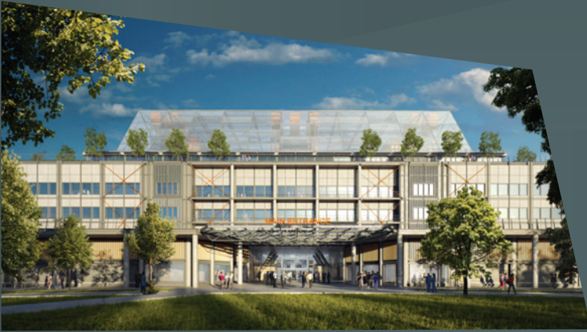
The Midland Met Learning Campus concept