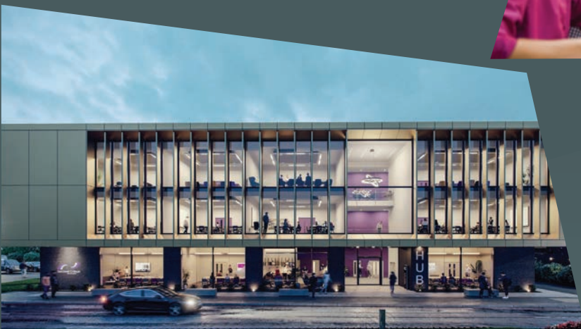
The Rowley Regis Education Hub concept