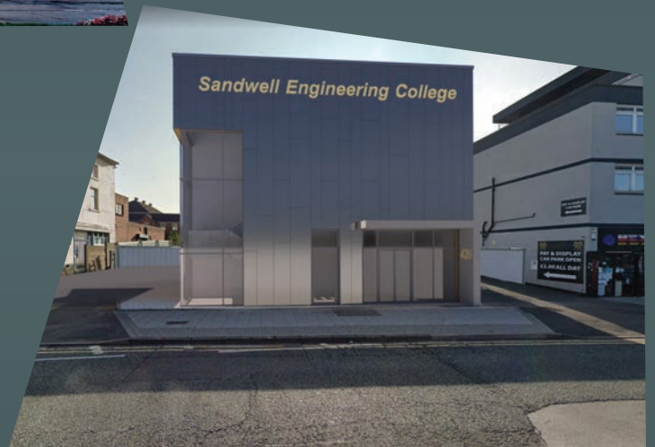
The Sandwell Civil and Mechanical Engineering Centre concept